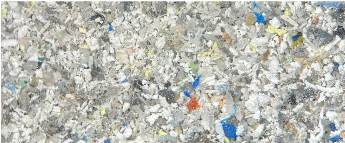
This magnified picture shows micronized recycled PVC

The sources of rPVC used in pipe production are mainly from the pipe and window profile industry. Both pre-consumer ('new' products as cut-offs in the profile industry) and post-consumer (old pipes and window profiles) material is available on the market. The recycling process is based on washing and mechanical milling. The end product is typically a micronized powder with a particle size of about 500-700µm, as shown in the picture below.