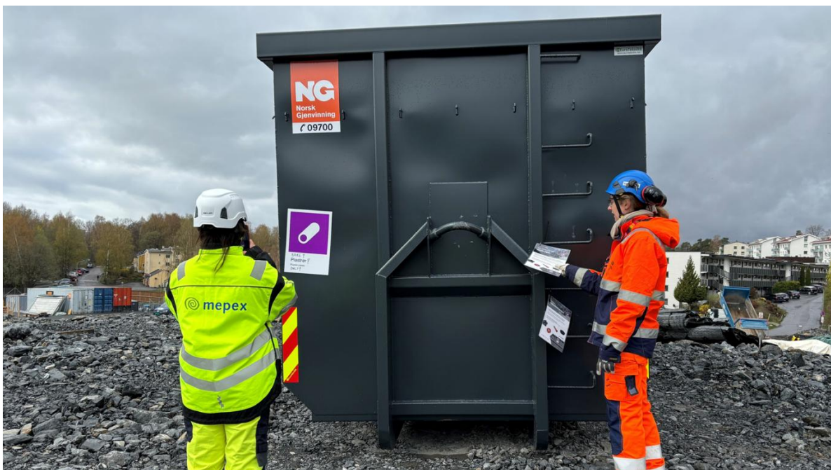
Container for collection of plastic piping scrap on a construction site

As a result of this project, several collectors offer this solution in the Norwegian market today. Hopefully this will give us more valuable high quality recirculates needed for the manufacture of pipes with high quality and a long lifetime.