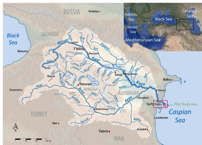
Fig. 1. Transboundary map of the Kura-Aras River Basin. The Kura River discharges into the Caspian Sea near Neftchala, Azerbaijan.

2022; Ginzburg et al., 2024). With over 90% of regional waste mismanaged, plastic inputs are expected to increase without intervention (Kaza et al., 2018).